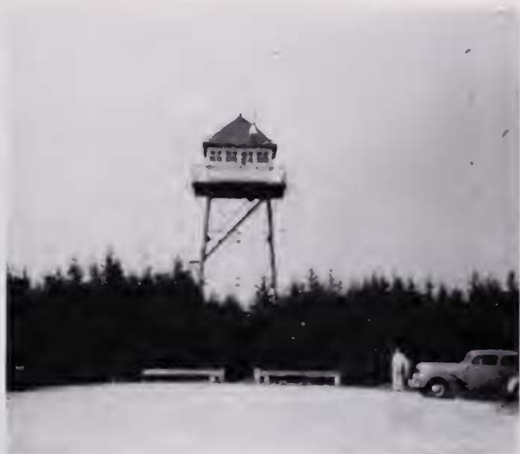
FIG. 1. Gaudineer Knob study area and Fire Tower, June 1948.

result has been a dense, almost pure, stand of spruce which forms an effective island surrounded by a nearly pure hardwoods forest. A spruce tree which fell in 1973 had a ring count of just over 50, indicating germination of the seed sometime between 1915 and 1920.